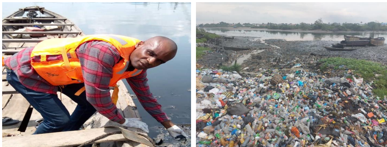
Fig. 1 Sample collection at the study location